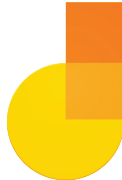
Activity on Google Jamboard

In the chat, indicate which of these ideas you think we should cover in the next CoP.